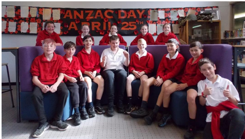
Casterton Primary School students enjoying the ANZAC display in the resource centre

To commemorate Anzac Day, the Resource Centre at Casterton Secondary College was the home to an extensive display of wartime memorabilia. Students composed letters from the trenches whilst another class replied from the home - front. The room was adorned with framed pictures from the Canberra War Memorial as well as photos and information that staff and students donated to be displayed.