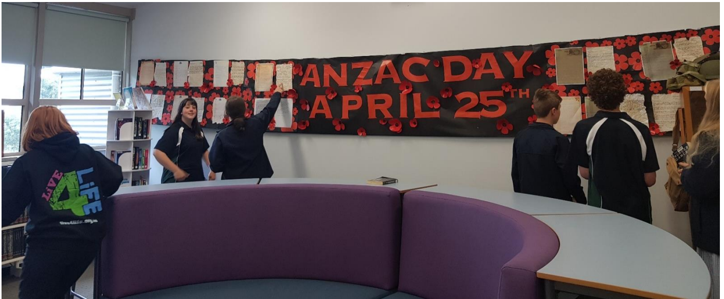
A fabulous ANZAC day display of letters written by students depicting those sent home from WW2 in the Resource Centre