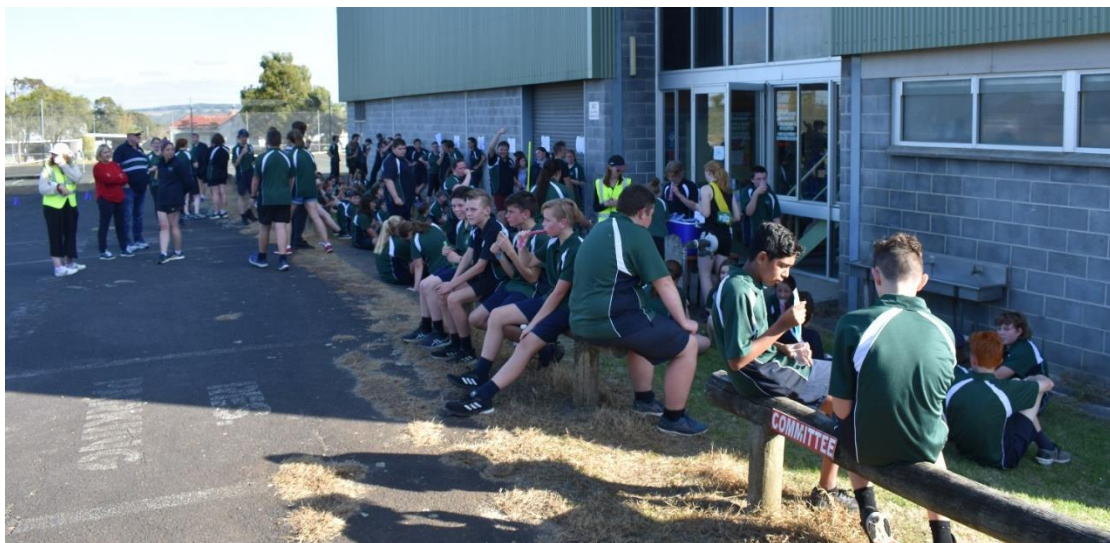
The finish line and well deserved ice blocks

Special thanks goes to all staff members who manned the stations and results tables to ensure that the event ran smoothly. Another thanks goes to parents and students who helped out through the afternoon, without this help events such as this could not run.